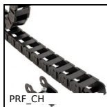
PRF_CH Cable-carrier chain for aluminium profile, Supplied in metre lengths