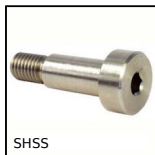
SHSS Shoulder screw stainless steel 416, Pre-treated 416 stainless steel