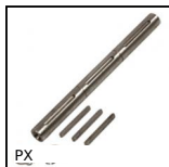
PX Optional output shaft stainless steel, P gearboxes double sided out...