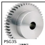
PSG35 Spur gear - precision range, Stainless steel 316