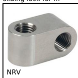
NRV Orthogonal support clamp, Orthogonal support clamp