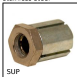
SUP Self-centering clamping hub steel, Without locknut