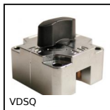
VDSQ Sliding lock adjustment system, Sliding lock for square profile