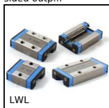
LWL Linear ball slide - Stainless steel balls, Chariot - from 514 N to 1...