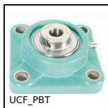
UCF_PBT Stainless steel/Polymer flanged bearing, Polymer and stainless steel