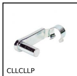
CLLCLLP Clevis components, long version, Steel - long version