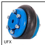
Uneflex® elastic coupling, range