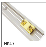
Drylin®N miniature guiding system, Width 17 mm