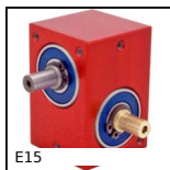
Right angle helical reducers, from 0.40 to 2.53 Nm