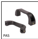
PAS Pull handle, Reinforced PA thermoplastic