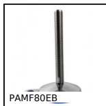
Articulated foot with sheet metal base Ø80, Articulated foot