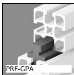
PRF-GPA Guide for aluminium profile, Parallel rails