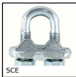
SCE U-shaped cable clamp, Steel