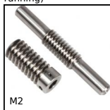
M2 Worm, Unhardened steel