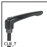
Die cast zinc clamping lever - male, Zamak