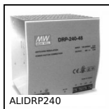
24V DC power supply, 10 A