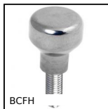
Mushroom headed button Hygienic Usit®, With male thread and high head