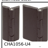
CHA1056-U4 Screwed hinge, 180°