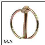
GCA Lynch pin, Lynch cam