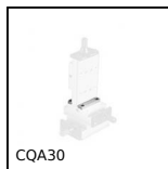
CQA30 Accessory for adjustment slide-system, 30