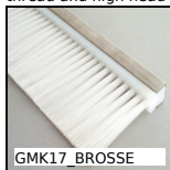
Brush strip, Cone-shaped - brush