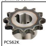
PCS62K Chain sprocket with hardened teeth, 15.875mm (DIN10B-1)