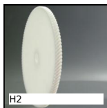
H2 Crossed helical gear crossed axis at 90°, Machined plastic (delrin)