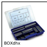
BOXdhx Boxed set of threaded dowel pins DIN7979D, Boxed set - extractable D...