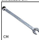
CM Tools Hygienic Usit® and Hygienic Design®, Combination spanner