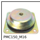
PMC150_M16 Anti-vibration machine mount, Square base plate