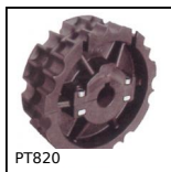
PT820 Drive sprocket for slat top chain, Ranges 820 and 815