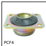
PCF4 Conical flexible mount, Square base plate