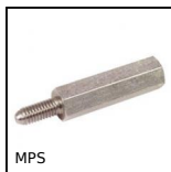
MPS Hexagonal spacer, Stainless steel 303