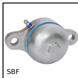
SBF Sealed flange bearing unit for Food Industry, cover