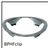
BPHFclip Clip for ball transfer unit, Insert clip - Installing from above