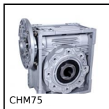
Worm and wheel gear reducer, up to 298 Nm