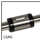
Sleeve for splined ball shaft, Chariot - from 514 N to 15386 N