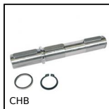
Single output shaft, For CHB gearbox