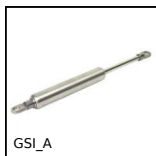
Stainless steel adjustable gas spring,