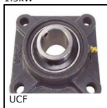
Cast iron flange bearing unit, Cast iron