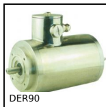
Stainless steel AC asynchronous motor 1.1 - 1.5kW, 1.1 to 1.5kW