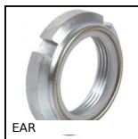
Bearing locknut, Self locking locknut - nylon lock washer