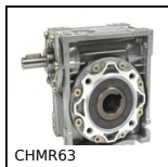
Worm and wheel gear reducer, up to 196 Nm