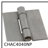
Square hinge with riveted pin, not drilled, Square with riveted pin,...