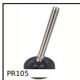
Articulated foot Ø103, Ø 103