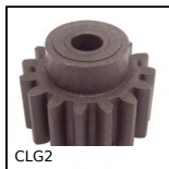
Moulded plastic spur gear, Moulded plastic (nylon)