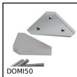
Connecting kits, XZ linking kit