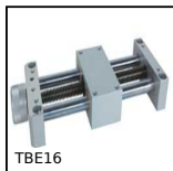
Economic mini-table with trapezoidal leadscrew, 5kg