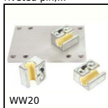
Drylin® W slide, slide assembly