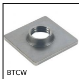
BTCW Cap for square tube to be welded, To be welded