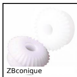
ZBconique Machined plastic bevel gear, 1:1