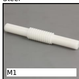
M1 Worm and wheel set, Machined plastic (delrin)