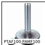
PTAF100-PAMF100 Articulated fixable foot with pressed base \varnothing 100 , \varnothing 100