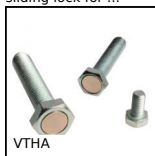
VTHA Magnetic screw with hexagonal head, Steel