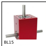
BL15 Right angled gearbox, from 1.10 to 6 Nm