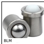
BLM Spring loaded plunger with ball tip, Stainless steel body