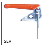
SEV Vertical stirrup toggle clamp, Vertical Latch