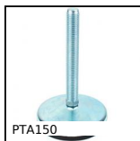
PTA150 Articulated levelling foot, pressed base Ø150, Ø 150