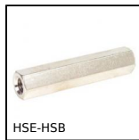
HSE-HSB Hexagonal spacer, Brass