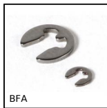
BFA Shaft locking washer, E clip