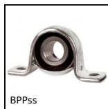
BPPss Pressed stainless steel pillow block, Stainless steel