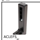
ACLEFS Floor anchor for aluminium profile, Adjustable