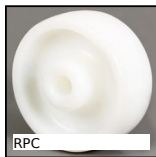
RPC Wheel, Polyamide