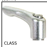
CLASS Stainless steel indexing handle - female, Stainless steel