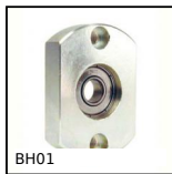
BH01 Single housed bearing, Bearing fitted with adhesive