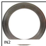
IN2 Internal gear, Steel 20NCD2