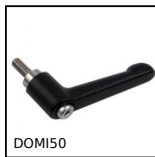
DOMI50 Accessories, Clamping lever