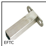
EFTC Fixing support, Stainless steel