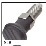
SLB Indexing plunger, stainless steel