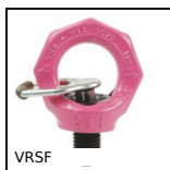
VRSF Male swivelling lifting ring, Male swivelling