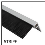
Sealing brush strip, 1m length