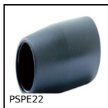
Conical flexible shaft handlee Ø22, Black