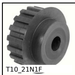
T type timing pulley, Economy range - T10 moulded plastic (nylon)