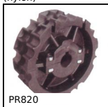
Idle sprocket for slat top chain, Rangs 820 and 815