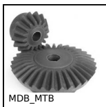
Moulded plastic bevel gear (nylon), 2:1