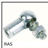
90° ball and socket joints DIN71802, Steel