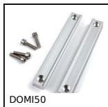
Accessories, Fixing kit