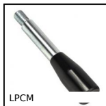
Lever with cylindrical handle, Black Duroplast, steel lever