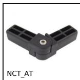
NCT_AT Variable angle connector, Variable angle