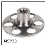
MSP23 Masterplate® glueable insert Ø23, Cylindrical Ø23 with threaded s...