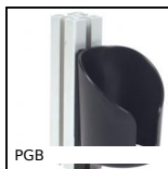
PGB Accessory-holder for aluminium profile, Tool holder