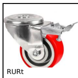
RURt Swivel castor with central hole, Polyurethane - Aluminium rim (Free ...)