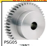
PSG05 Spur gear - precision range, Pre-hardened Steel 35NCD6