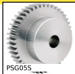
PSG05S Spur gear - precision range, Stainless steel 316