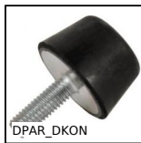
DPAK_DKON Progressive stop, Steel