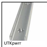
UTKpwr V shaped channel UtiliTrak®, V rail