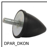
Conical elasto buffer, Steel