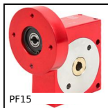
Worm and wheel gear reducer, up to 3,75 Nm