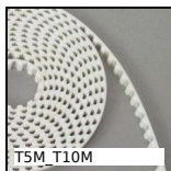
T type timing belt per metre, T5 Steel cored polyurethane