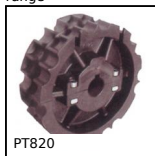
Drive sprocket for slat top chain, Ranges 820 and 815