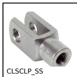
Clevis components, short version, Stainless steel - short range