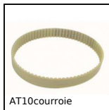
AT type timing belt, AT10 Steel cored polyurethane