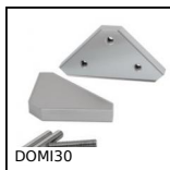
Connecting kits, XZ linking kit