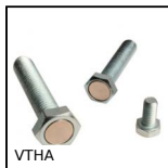
Magnetic screw with hexagonal head, Steel