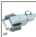
Spring loaded toggle latch, With padlock-holder