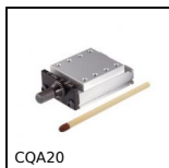
CQA20 Adjustment slide- system miniature, 20