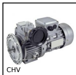
CHV Mechanical speed variator, from 0,18 to 1,5kW