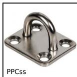
PPCss Pad eye on mounting plate squarred, Stainless steel