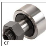
CF Cam follower, Standard - steel