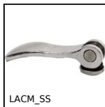
Stainless steel cam lever, Female