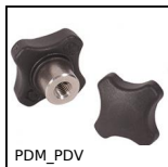
Detectable plastic palm grip, by metal detectors