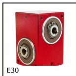
Right angle helical reducers, from 1.50 to 9 Nm