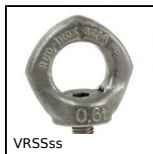
Male swivelling lifting rings stainless steel, Male swivelling - s...