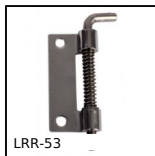
Spring loaded latch, Spring return latch - stainless steel