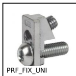
Universal fastener for aluminium profile, Universal