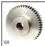
Steel spur gear, Steel 20NC2