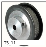
T type timing pulley, T5 aluminium