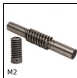
Worm and wheel set, Hardened steel