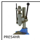
Manual workbench press, Force up to 600kg