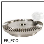
Eco. range steel bevel gear, 4:1