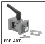
Articulated bracket for use with aluminium profile, With clamping ha...