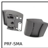
Closing system for aluminium profile, Easily adjustable lock