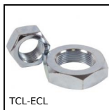
Adjusting nut, Fine thread