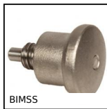
Indexing plunger mini, miniature - Stainless steel