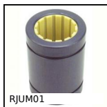
Closed polymer Drylin® R bearing,