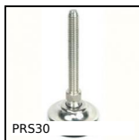
Stainless steel articulated foot Ø30,