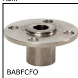
Ball pin socket, Mounting collar with a