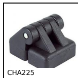
Screwed hinge with threaded insert, 225 degrees