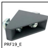
Bracket for aluminium profile, PRF19 to PRF45