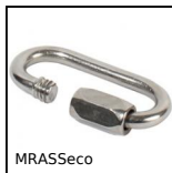
Low cost stainless steel quick link, Stainless steel