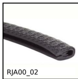
Sealing strip, Clipping