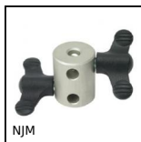
Multiple junction clamp, Multiple