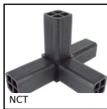
NCT Square tube connector, Fixed angle