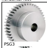
PSG3 Spur gear - precision range, Pre-hardened