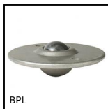
BPL Ball transfer unit light duty, Light