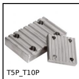
TSP_T10P Connecting plate for T type timing belts, T5