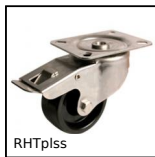
RHTplss High Temperature Castor, up to 200kg