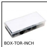
BOX-TOR-INCH Box set of Nitrile O-rings in inch NBR90Sh A, For fasteners and fitt...