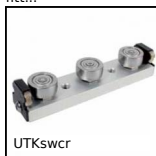
UTKswcr Utilittrak® 3 wheels carriage, Steel roller carriage