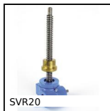
SVR20 Screwjack with travelling nut, with moving nut