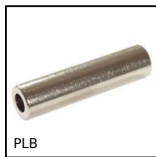
PLB Cylindrical spacer, Brass