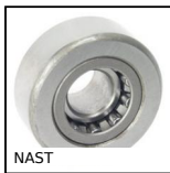
NAST Cam follower without axial guide, With interior ring