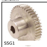
SSG1 Stainless steel spur gear, Stainless steel 304L