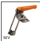
SEV Vertical stirrup toggle clamp, Vertical Latch Clamp - stainless steel