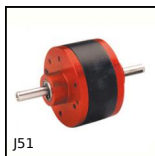
J51 Spur gear coaxial gearbox, from 0.13 to 0.25