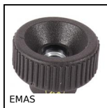
EMAS Antistatic knurled nut, Antistatic