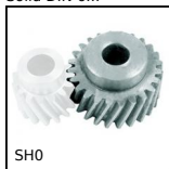
SH0 Parallel axis helical gear, Steel 20NCD2