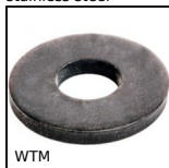
WTM Tightening washer - DIN6340, Steel