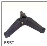
ESST Tripod support base, Tripod support base