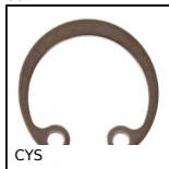
CYS Internal circlip DIN472, internal DIN 472