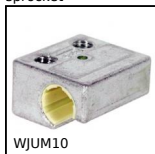
WJUM10 Drylin® W bearing block, Slide