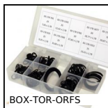
BOX-TOR-ORFS Box set of Nitrile O- rings NBR90Sh A, 7.65 x 1.78mm to 37.82 x