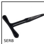
SERB Universal latch key, Universal latch key