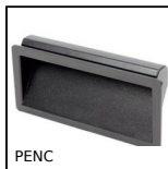
PENC Recessed handle, clip- in