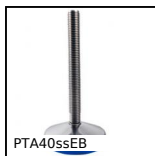
PTA40ssEB Articulated foot whit sheet metal base Ø40, Ø 40