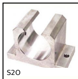
S20 Short housing for open linear bearing, Opened - slim