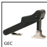
Rubber latch clamp with strike plate, Lockable