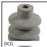
Suction cup, 2.5 bellows, natural rubber