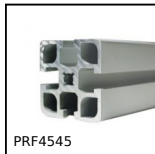
Standard aluminium profile, 45 x 45 mm