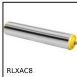
Free roller, Steel