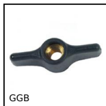
Female wing knob, Fully threaded