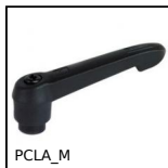
Technopolymer clamping lever - female, Plastic