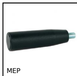
Revolving handle for handwheel, Fixed