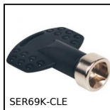
Quarter turn latch for the food industry, Stainless steel key