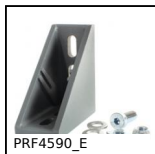
Bracket for aluminium profile, PRF4590