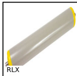
Free running conveyor roller, PVC