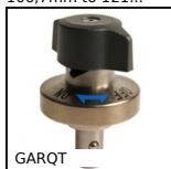
GARQT Quarter turn lock pin for clamping, Quarter turn