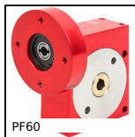
PF60 Worm and wheel gear reducer, up to 118 Nm