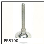
PRS100 Stainless steel articulated foot Ø100, Ø 100