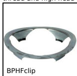
BPHFclip Clip for ball transfer unit, Insert clip - Installing from above