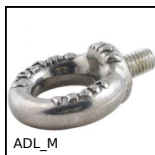
ADL_M Male eye bolt conforms to DIN580,