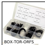
BOX-TOR-ORFS Box set of Nitrile O- rings NBR90Sh A, 7.65 x 1.78mm to 37.82 x 1.78