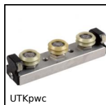
UTKpwc Utilittrak® 3 wheels carriage, Polymer series V wheels