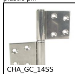
CHA_GC_14SS Stainless steel garnet hinge, To screw