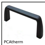
PCatherm Pull handle, Thermoplastic