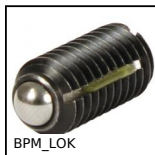
BPM_LOK Long-Lok slotted spring plunger with ball tip, LONG-LOK - Steel