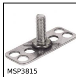
MSP3815 Masterplate® glueable insert rectangular, rectangular with