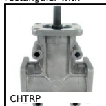
CHTRP Single and dual output gearboxes, Up to 28,8 Nm