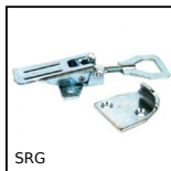
SRG Adjustable latch clamp with strike plate, Stroke from 78mm to 90mm