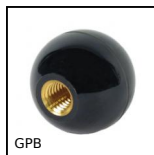
GPB Threaded spherical knob, With brass insert