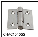
CHAC4040SS Square hinge with riveted pin, drilled, Square with riveted pin, dri...