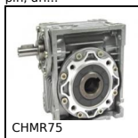
CHMR75 Worm and wheel gear reducer, up to 298 Nm