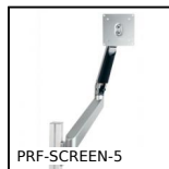
Screen support, Support with 5 axes of rotation