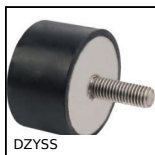
Stainless steel cylindrical stop, stainless steel