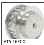
AT type timing pulley, Economy range - AT5 aluminium