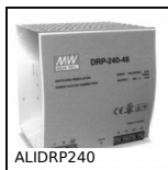
24V DC power supply, 10 A