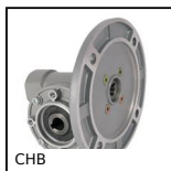
Worm and wheel gear reducer, up to 41 Nm