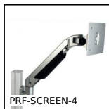
Screen support, Support with 4 axes of rotation