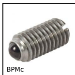
Stainless steel slotted spring plunger with ceramic ball tip, 303