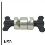
Adjustable clamp, Adjustable