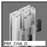
Hinge and joint, Lift- off hinge