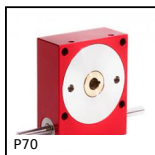
Worm and wheel gear reducer, up to 164 Nm