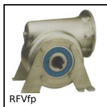
Stainless steel worm and wheel gearboxes, Mounting bracket