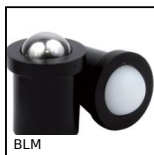
Spring loaded plunger with ball tip, Plastic body