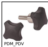
Detectable plastic palm grip, by metal detectors