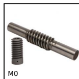
Worm and wheel set, Hardened steel