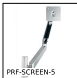
Screen support, Support with 5 axes of rotation