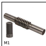
Worm and wheel set, Hardened steel