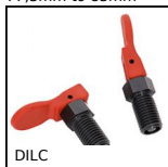
Indexing plunger with cam, with cam