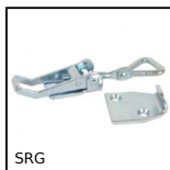
Adjustable latch clamp with strike plate, Stroke from 77,3mm to 83mm