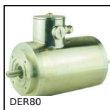
Stainless steel AC asynchronous motor 0.55 - 0.75kW, 0.55 to