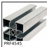
Standard stainless steel profile, 45 x 45 mm