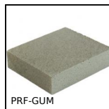
Aluminium profile anodising polisher, Polishing block