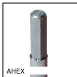
AHEX Hexagonal shaft, Hexagonal shaft