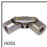
HDSS Needle roller double universal joint - Stainless steel, Heavy duty