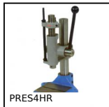
PRES4HR Manual workbench press, Force up to 600kg