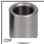
CDP Flanged drill bushing, Steel