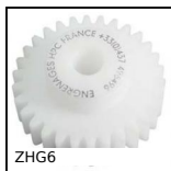
ZHG6 Plastic spur gear, Machined plastic (delrin)