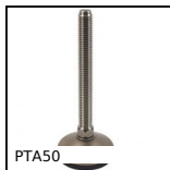
PTA50 Articulated levelling foot, pressed base Ø50, 4000N