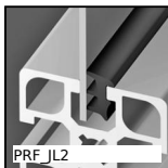
PRF_JL2 Lip seal for panel, Door seal - Ø 2mm