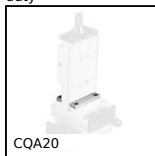
CQA20 Accessory for adjustment slide- system, 20