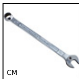
Tools Hygienic Usit® and Hygienic Design®.