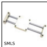
Linear table, For small lengths