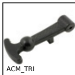
Manual bonnet fastener, Black rubber fastener