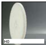
90° crossed axis helical gear, Machined plastic (delrin)