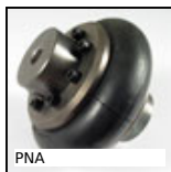
PERIFLEX elastic coupling, Complete coupling