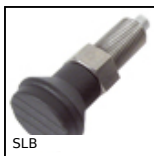
Indexing plunger, stainless steel