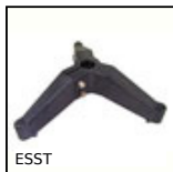
Support base, Tripod support base