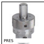
Accessories for PRES-3HR and PRES-4HR presses, Micrometric