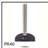
Fixable articulated foot - polyamide, Ø 50