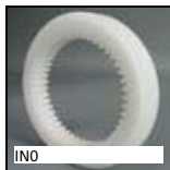
Internal gear, Machined plastic (delrin)