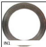
Internal gear, Steel 20NCD2