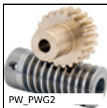
Wheel - precision range, Bronze