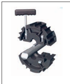
Two part design