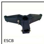
ESCB Combined bipod support base, Bipod support element with cross support