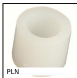
PLN Cylindrical spacer, Thermoplastic