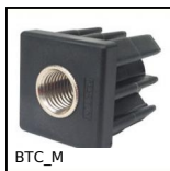
BTC_M End cap with threaded insert for square tube,