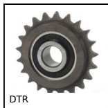
DTR Chain idler sprocket, Chain idler sprocket - Plastic