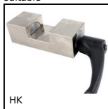
HK Manual locking clamp, Manual locking clamp LWH