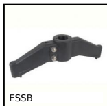
ESSB Bipod support base, Bipod support base