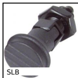
SLB Indexing plunger, steel class 5.8