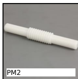
PM2 Worm and wheel set, Machined plastic (delrin)