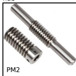
PM2 Worm and wheel set, Non hardened steel