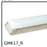
GMK17_R Round guide, Round guide for conical profile