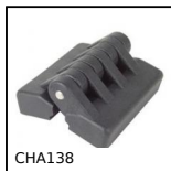
CHA138 Screwed hinge with threaded insert, 138 degrees