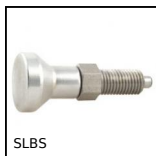
SLBS Stainless steel indexing plunger,