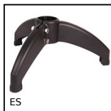
ES Support base (tripod), Plastic