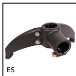
ES Bipod support base, Plastic