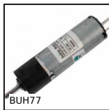
BUH77 Motor-gearbox 12V and 24V DC, from 0.1 to 2 Nm