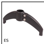
ES Simple support base (bipod), Plastic