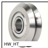
HW_HT Half-rail guide, Wheel