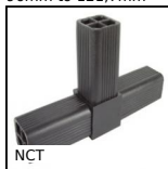
NCT Square tube connector, Fixed angle