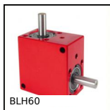
BLH60 Right angled gearbox, from 19 to 70 Nm