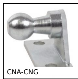
CNA-CNG Right angled mounting plate, Right angled mounting plate for ball jo...