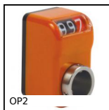
OP2 Mechanical digital position indicator, 3 numbers