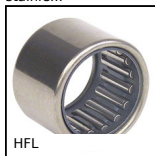
HFL One way needle bearing, Needle bearing with flange