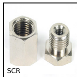
SCR Suction cup threaded insert, Adaptor for insert