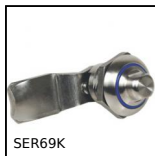
SER69K Quarter turn latch for the food industry, Stainless steel