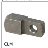
CLM Male clevis end, Stainless steel short