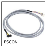
ESCON Speed controller 5A accessories, Kit of 4 cables for DC motor