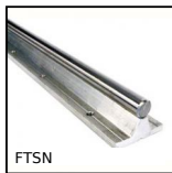
FTSN Supported shaft for linear guide, Steel shaft / Aluminium support