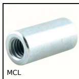
MCL Cylindrical threaded sleeve, Cylindrical - steel