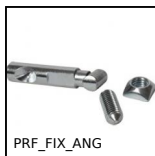
PRF_FIX_ANG Fastener for aluminium profile, Angular joint