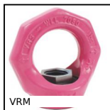
Male swivelling lifting ring, Male swivelling