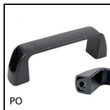
PO Pull handle - Multi- sector, Smooth hole