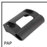
PAP Handle for aluminium profile, Ergonomic handle