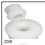
ZDB Machined plastic bevel gear , 2:1