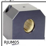
RJUM05 Drylin R® linear bearing housing, Closed - Long