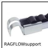
RAGFLOWsupport Floway2® Roller track accessory, Roller track support