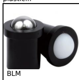
BLM Spring loaded plunger with ball tip, Plastic body