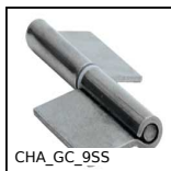
CHA_GC_9SS Stainless steel garnet hinge, To be welded