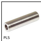
PLS Cylindrical spacer, Stainless steel 303