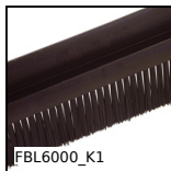
FBL6000_K1 Brush strip per meter PA6 fibres Ø0.2 to Ø0.3, Black polyamide 6 -...