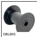
DBL805 Idler for slat top chain, Range 805