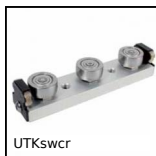
UTLkswcr Utilittrak® 3 wheels carriage, Steel roller carriage