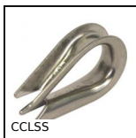
CCLSS Stainless steel wire thimble, Stainless steel