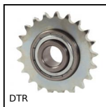
DTR Chain idler sprocket, Chain idler sprocket - Steel