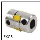
EKGS Backlash free coupling Gerwah®, from 0.5 to 35Nm