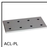
ACL-PL Joining plate for aluminium profile, joint plate - 176x86 mm