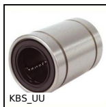
KBS_UU Stainless steel closed precision linear bearing, Precision - stainle...