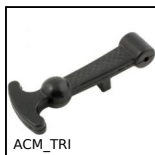
ACM_TRI Manual bonnet fastener, Black rubber fastener