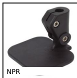
NPR Reflector support,