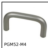
PGM52-M4 Push/Pull handle, Aluminium