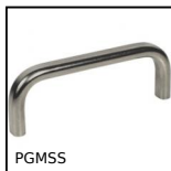
PGMSS Stainless steel push/pull handle, Stainless steel