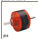
J64 Spur gear coaxial gearbox, from 0.57 to 2.25 Nm - In-line