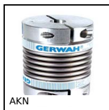
AKN Bellows coupling Gerwah®, from 22 to