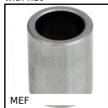
MEF Cylindrical sintered ferrous bush, Self- lubricating FP20 ferrous all...