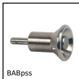
BABpss 301 Stainless steel ball pin, Stainless steel