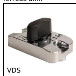
VDS Sliding lock adjustment system, Sliding lock for oblong hole