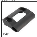
PAP Handle for aluminium profile, Ergonomic handle