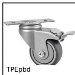
TPEpbd Castor for aluminium profile, Swivel with brake