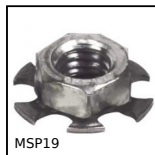
MSP19 Masterplate® glueable insert Ø19/Ø20, Cylindrical with nut