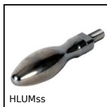
HLUMss Revolving handle for handwheel, Stainless steel 316