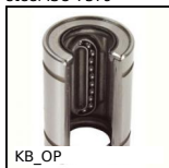
KB_OP Open precision linear bearing, Precision - steel