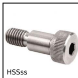
HSSss Stainless steel shoulder screw ISO7379, Stainless steel ISO 7379