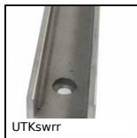
V shaped channel UtiliTrak®, V rail