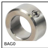
Locking rings in stainless steel, Stainless steel