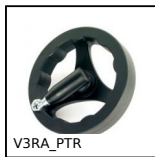
3-spoked handwheel with foldable handle, Polyamide