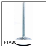
Articulated levelling foot, pressed base Ø80, Ø 80