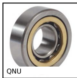
Single row cylindrical roller bearing, Free inner ring