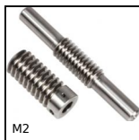
Worm and wheel set, Unhardened steel