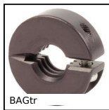
Lead screw clamping collar, Aluminium