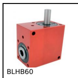
Right angled gearbox, bored shafts, up to 70 Nm