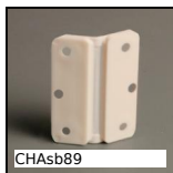
Hinge without pin, Plastic hinge