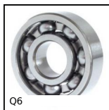
Deep groove ball bearing, Steel