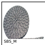
Single chain supplied by the metre, Stainless steel