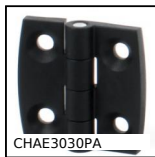
Square decorative screwed hinges, Polyamide