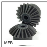
Moulded plastic bevel gear (nylon), 1:1