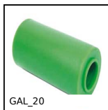
Conveyor roller for Ø20mm spindle, Self-lubricating polyamide