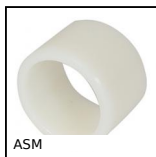
Cylindrical polymer bush, Food grade polymer