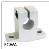
End support, With base