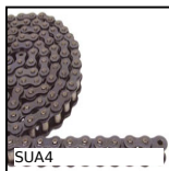
Single chain supplied by the metre, Steel