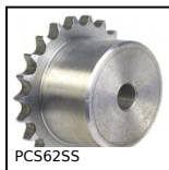
Chain sprocket - Stainless steel, 15.875mm (DIN 08B-1)