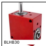
Right angled gearbox, bored shafts, up to