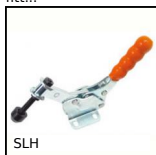
SLH Horizontal toggle clamp, Horizontal Lever Clamp - steel