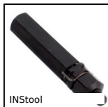
INSTool Insertion tool for self tapping inserts, Insertion tool