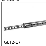
GLT2-17 Telescopic drawer runners for groove mounting, Partial extension