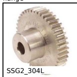
SSG2_304L Stainless steel spur gear, Stainless steel 304L