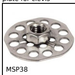
MSP38 Masterplate® glueable insert Ø38, Cylindrical Ø38 with tapped inserts