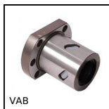
VAB Flanged nut for ball screw, For VAB ballscrew