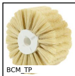
BCM_TP Modular cylindrical brush, Tampico bristles