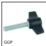
GGP Male wing knob, Technopolymer with brass spindle