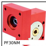
PF30NM Worm and wheel gear reducer, up to 8.8 Nm