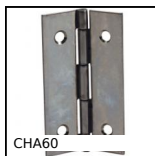
CHA60 Rectangular hinge, drilled or countersunk,