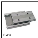
BWU Compact precision slide, from 1510 N to 20000 N