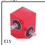
E15 Right angle helical reducers, from 0.40 to 2.53 Nm