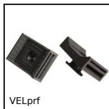
VELprf Clip-on base for hook-and-loop strip, Polyamide