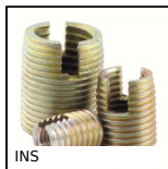
INS Self tapping steel insert, Steel