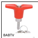
BABTV Ball lock pins lockable , Stainless steel