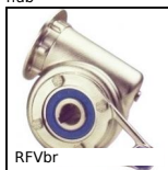
RFVbr Stainless steel reaction arm, Reaction arm