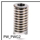
PW_PWG2 Worm - precision range, Stainless steel