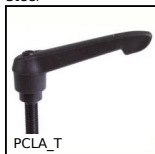
PCLA_T Technopolymer clamping lever - male, Plastic