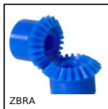
ZBRA Machined plastic bevel gear , 1:1