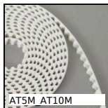
AT5M AT10M AT type timing belt per metre, AT5 Steel cored polyurethane