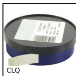
CLQ 12.7mm wide steel feeler strip on rolls, Feeler strip on rolls