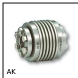
AK Bellows coupling Gerwah®, from 36 to 800Nm