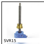
SVR15 Screwjack with travelling nut, with moving nut