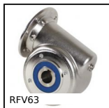
RFV63 Stainless steel worm and wheel gearbox, up to 152 Nm