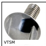
VTSM Ball head screws Hygienic Design®.