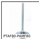
PTAF80-PAMF80 Articulated fixable foot with pressed base \varnothing 80 , \varnothing 80