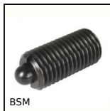
BSM Spring plunger with internal hexagonal socket, steel body and pin