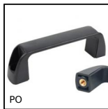
PO Pull handle - Multi-sector, Tapped recessed insert