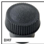
BMF Knurled knob - female, Knurled - blind