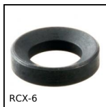
RCX-6 Spherical tilt washer - DIN6319, concave