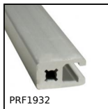
PRF1932 Standard aluminium profile, 19 x 32 mm